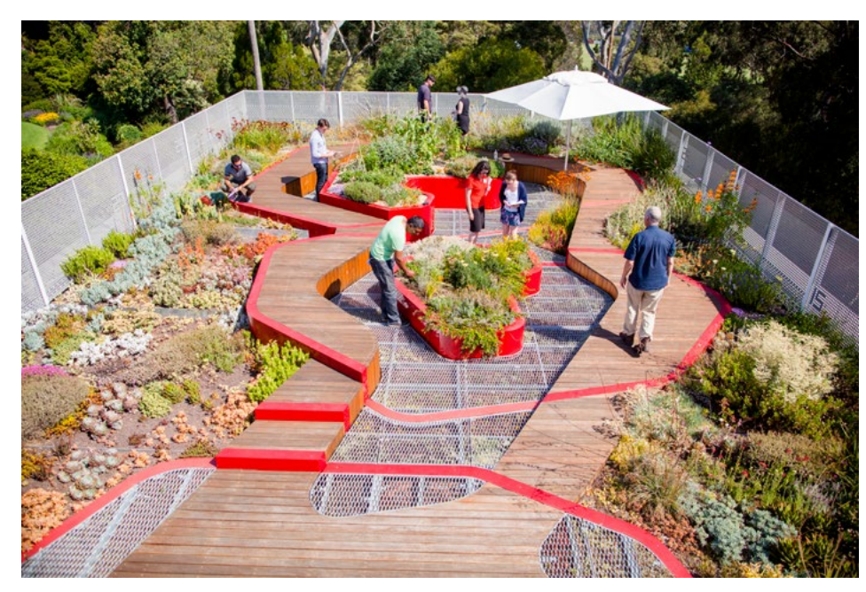
The Burnley Demonstration green roof, University of Melbourne.

Discussions amongst stakeholders are now underway on how to progress actions outlined in the Roadmap.